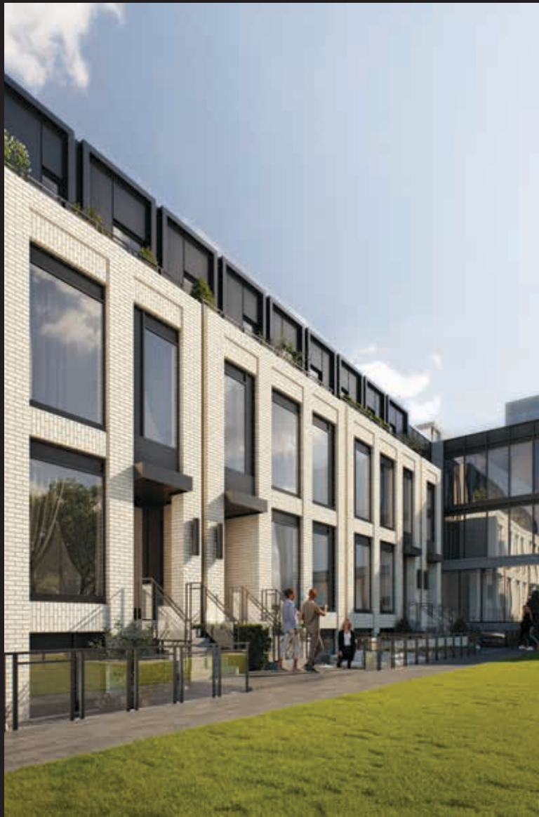
WALK UP RESIDENCES