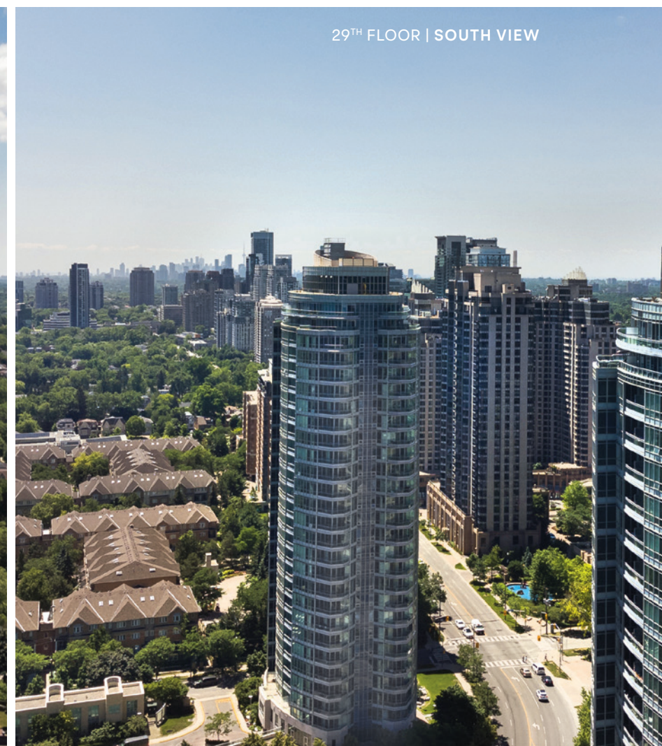
29 TH FLOOR | SOUTH VIEW