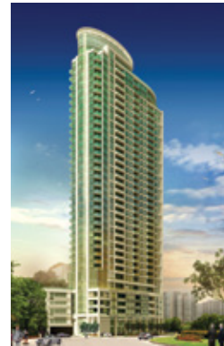
WIDE SUITES MISSISSAUGA